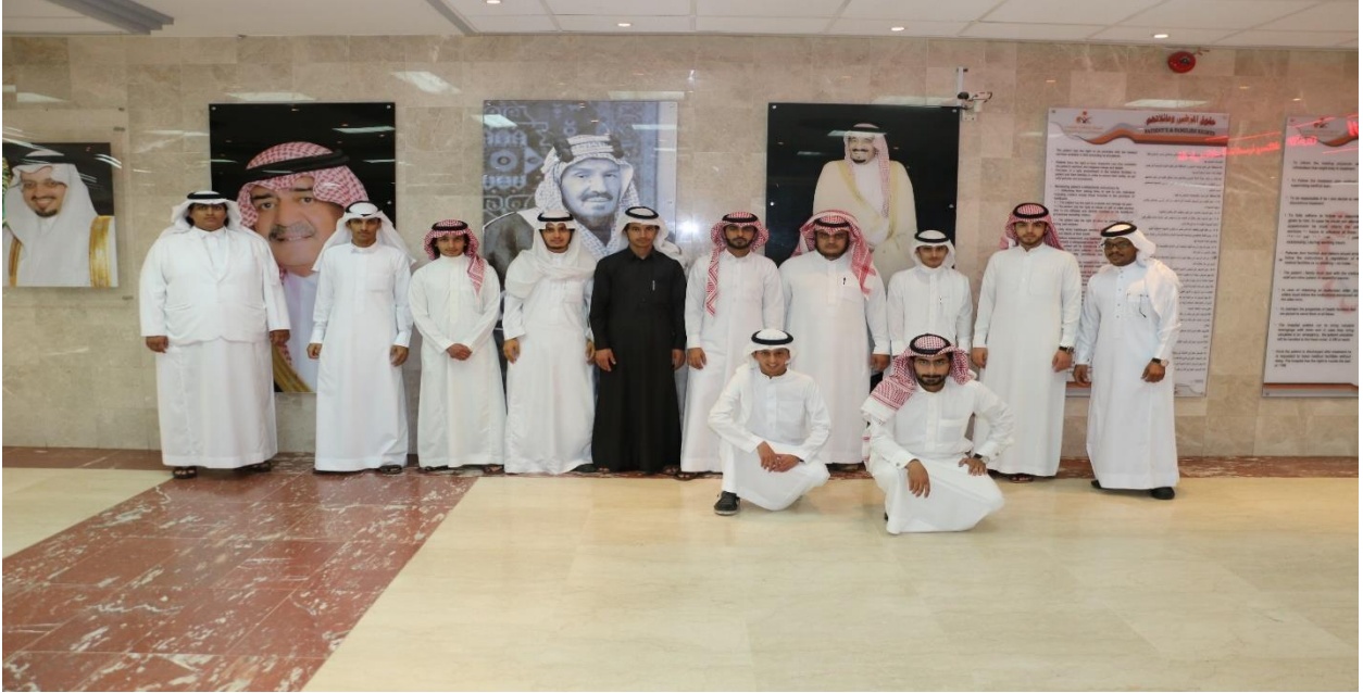
3- The school laboratory supervisors in the Department of School Equipment and Education Technologies visited the Biology Department on Sunday 4/7/1440.