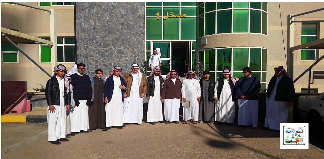
2- The students of Rowad Abha Secondary School visited the Department of Biology on Sunday 3/24/1440.